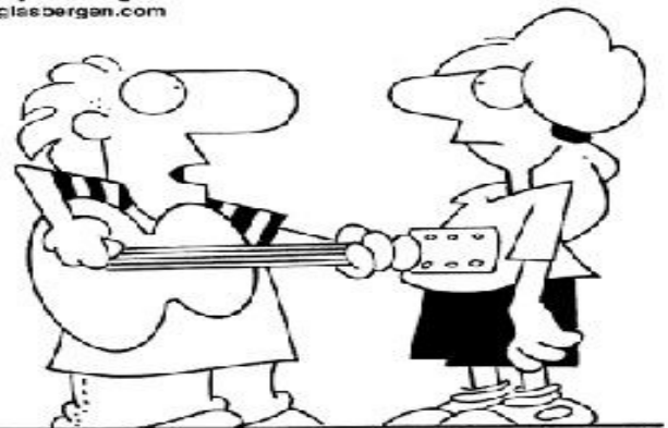
"Writing hymns is harder than I thought! I can't think of anything that rhymes with 'Hallelujah' except 'glad I knew ya' and 'we'll tattoo ya!'"