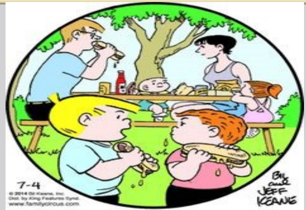
7-4 © 2014 St. Ignace, Inc. Dist. by King Features Synd. www.familygrouse.com "Today's a good day to eat hot dogs, 'cause that's what our fourth fathers always ate."